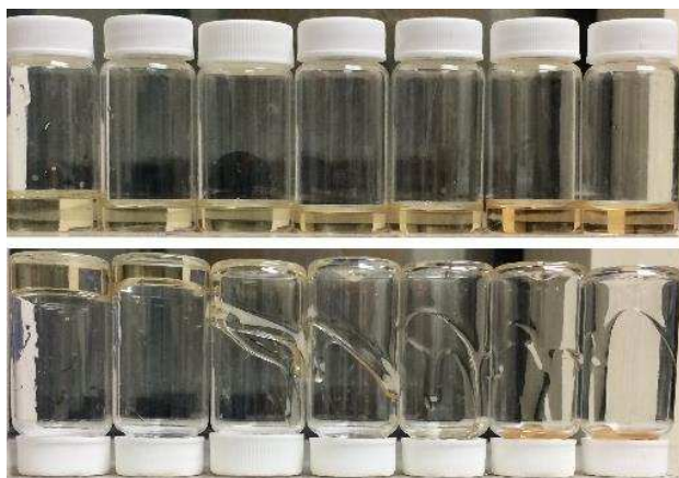
Figure 1: hA/QVP20 samples used in rheological experiments. The sol-gel transition is induced by DMSO/water mixed solvents. From left to right, the water contents are: 30 wt.%, 25 wt.%, 20 wt.%, 15 wt.%, 10 wt.%, 5 wt.%, and 0 wt.%.