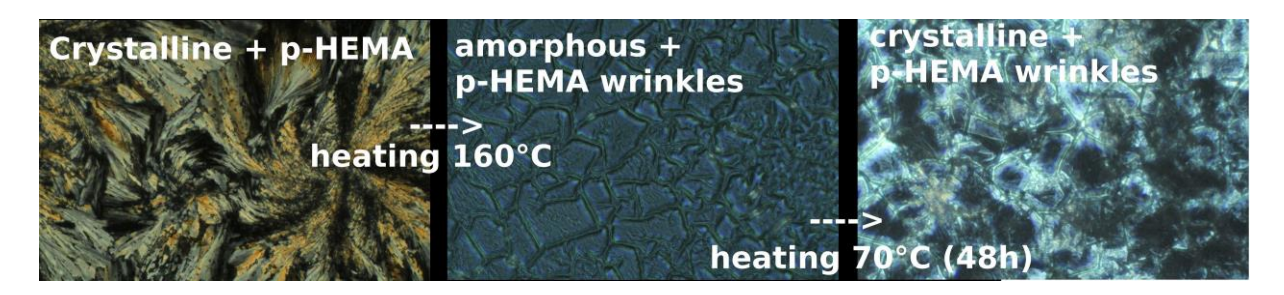
Figure S2. Crystalline clotrimazole coated with a p-HEMA layer (left), the same sample heated above 160°C and rapidly cooled to room temperature (middle) and the sample stored at 70°C for another 48h.