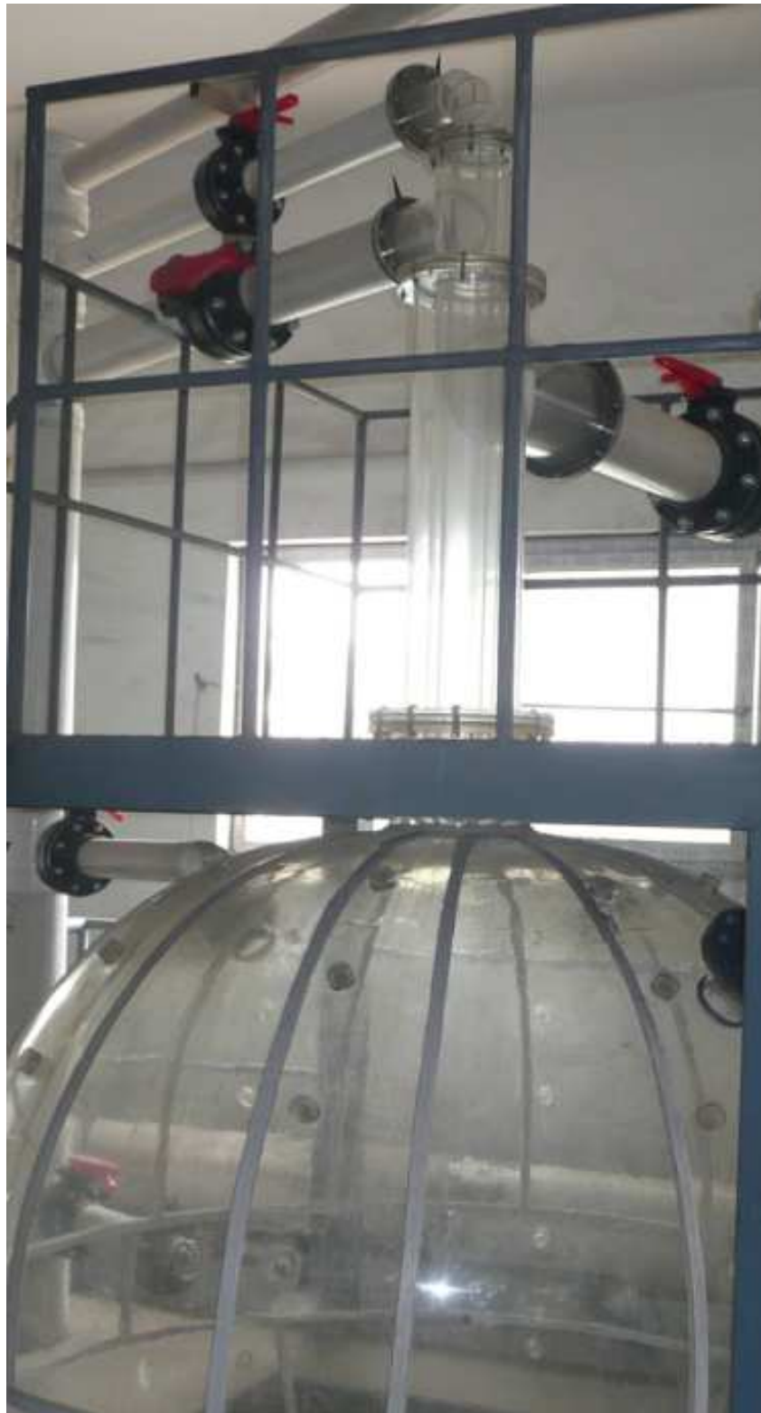
(b) Primary nozzle