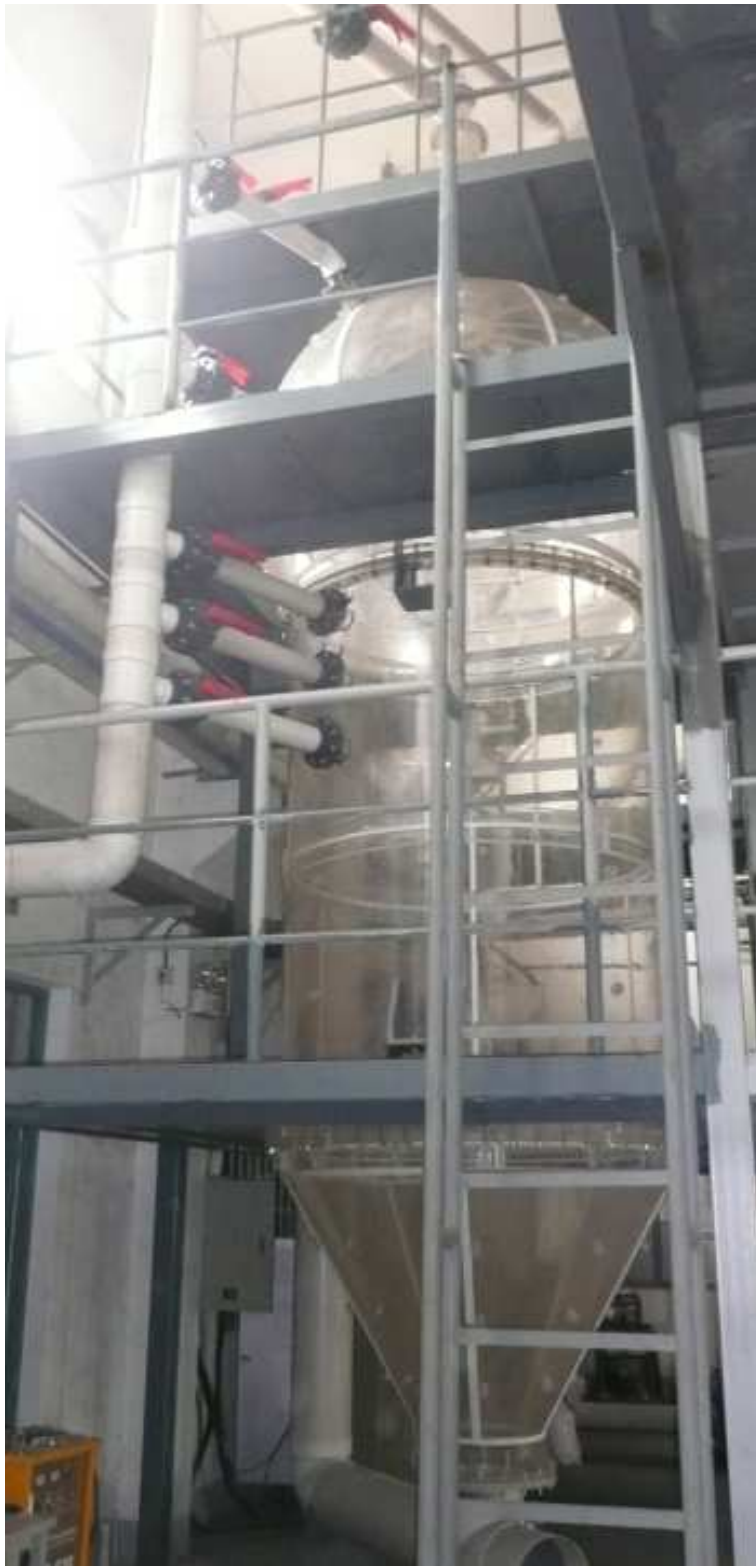
(a) Full body