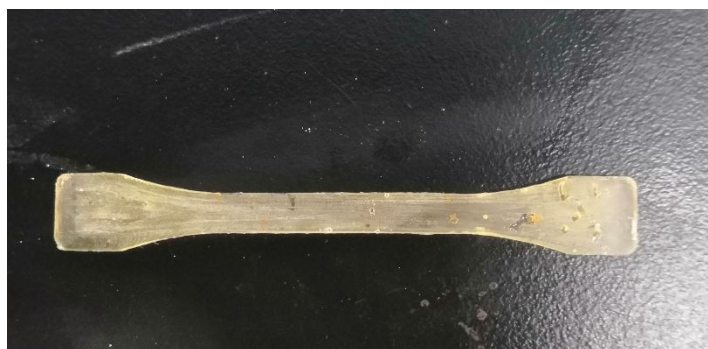
Figure S2 EER is degraded by thiol and continues to be used for epoxy E51 curing.