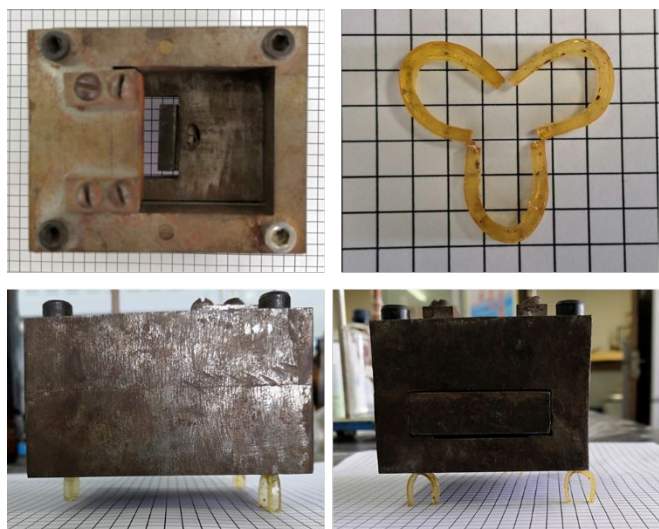
Figure S3 Test of supporting weights after shape memory. (a, c, d) three views of the load bearing material; (b) epoxy resin for support. (Epoxy resin weighs 0.7644g, weight iron block weighs 1845.5g).